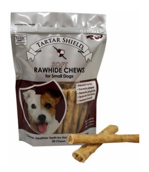
Tartar Shield Rawhide Chews