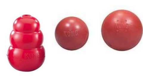
Kongs and Kong balls