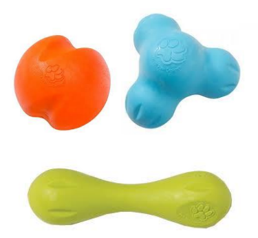
West Paw Toys