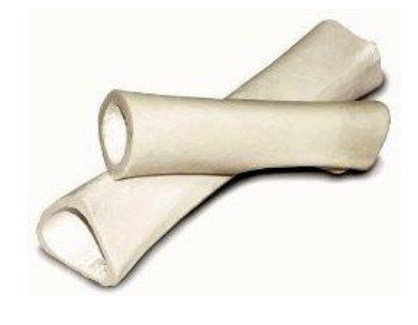
Marrow bones: stuffed, hollow raw or cooked