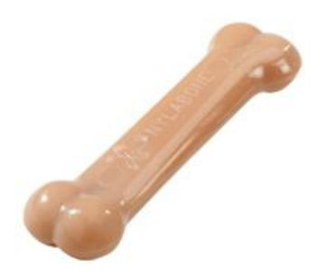
Hard nylon toys